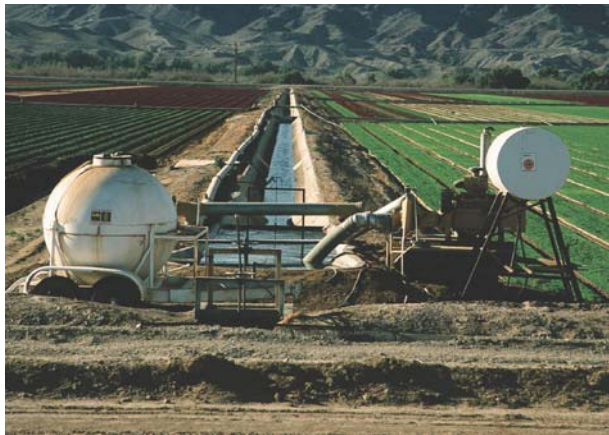
Fertilizer application applied directly into irrigation lateral for flood application, Yuma, AZ.

Once in the environment, E. coli O157 can move in several ways around agricultural landscapes. The two most common ways are through the land application of raw, uncomposted manure, and through runoff of manure or lagoon water into streams and irrigation ditches.