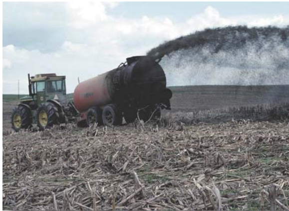
Liquid manure being pumped with a "honey wagon."

In a unique study focusing on E. coli O157 cases in Canada, scientists used 80 indicators of livestock density to study linkages between farm animals and E. coli illnesses. The strongest positive association between E. coli case frequency and a livestock density indicator was the ratio of beef cattle population to human population (Valcour et al., 2002).