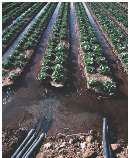
Siphon tubes used for furrow irrigation on Romaine lettuce, Yuma, AZ.

Survival times vary greatly as a result of soil and weather conditions. Avery et al. (2005) found that E. coli O157 bacteria were still viable in 77% of a number of organic wastes two months after land application. They concluded that storage of wastes will help reduce bacteria numbers, but cannot be counted on to totally eliminate E. coli O157.