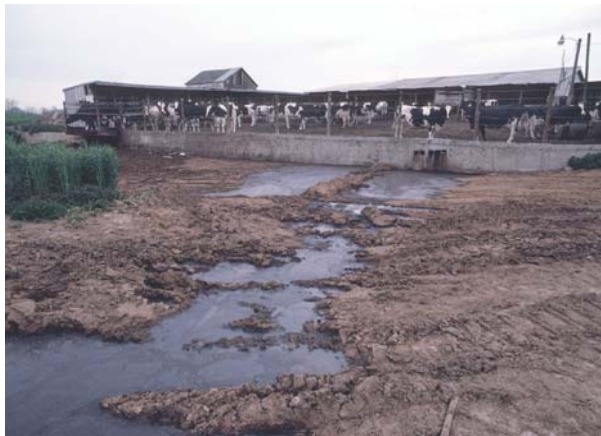
Runoff from this livestock yard may enter a nearby stream and degrade water quality.

Gilbert et al. (2005) found that enterohaemorrhagic E. coli [EHEC] levels were 100-times higher in cattle feed a high grain ration, compared to animals on a roughage-based diet. Herriot et al. (1998) reported that dairy heifers feed corn silage were more likely to have E. coli O157, compared to heifers not feed silage.