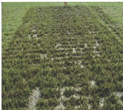
Standing manure water in a vegetable ‘test plot’.

There is an enormous body of science on pathogenic E. coli O157 that provides important clues to where this dangerous organism comes from, how it can make its way to food, other ways people are exposed, and further steps that can be taken to reduce the terrible burden of disease linked to pathogenic E. coli strains. This “Critical Issue Report” provides a roadmap to published research, and teams of scientists conducting cutting edge work to better understand E. coli epidemiology. Each reference