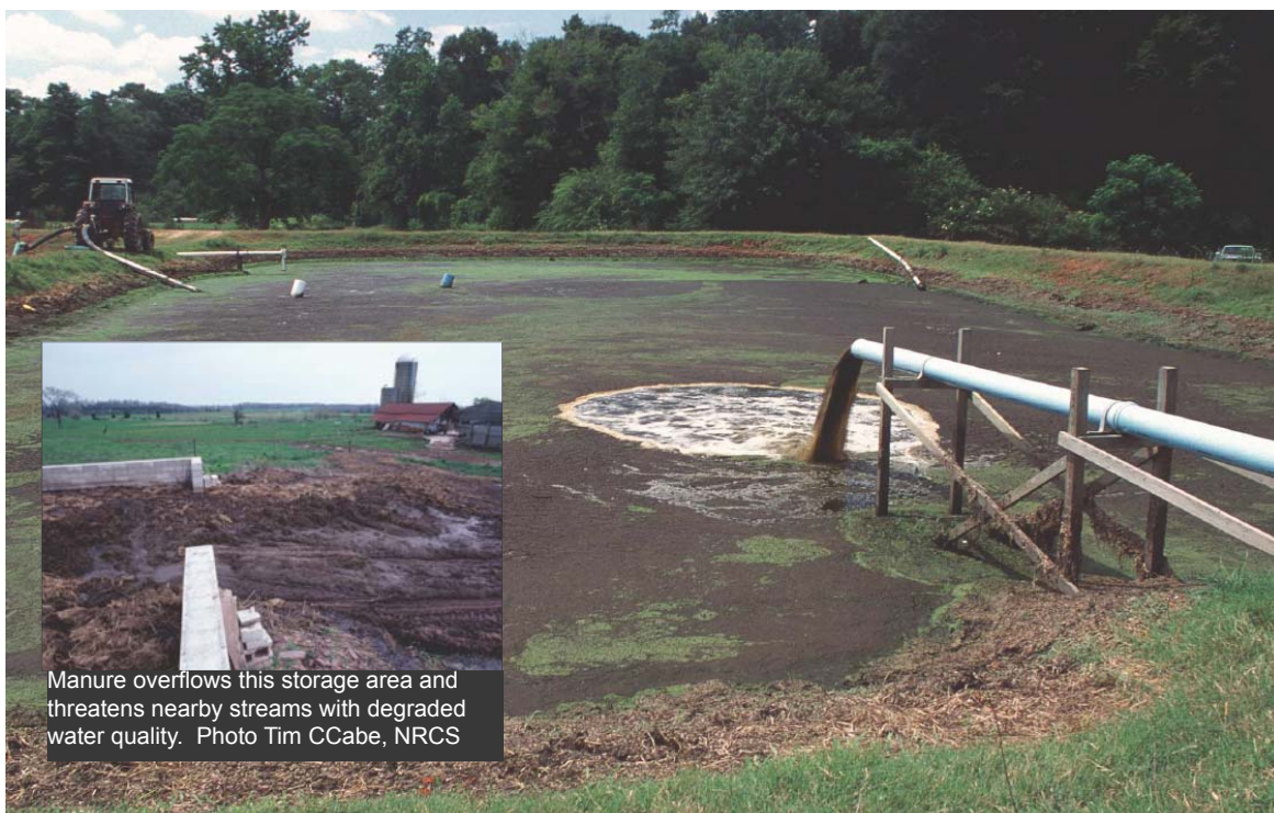
Manure overflows this storage area and threatens nearby streams with degraded water quality.

Work by Mukherjee et al. (2006) in Minnesota found that the use of manure or compost aged more than 12 months on organic vegetables reduced E. coli levels by 19-fold.