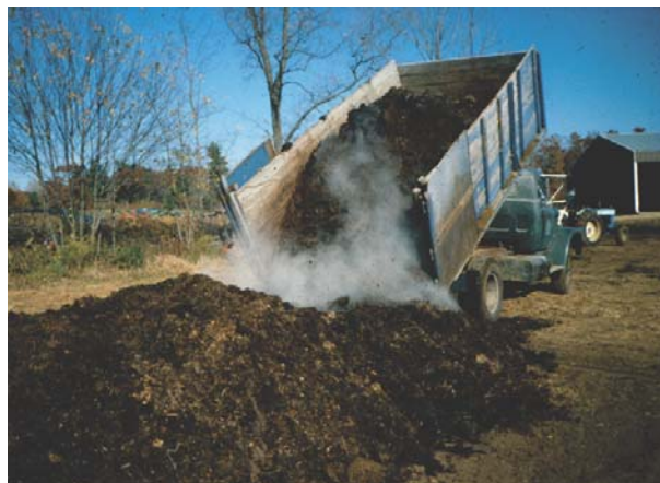
Building compost windrows in Massachusetts.

Most scientists who have studied the impacts of manure management, composting systems, and manure and compost application methods on E. coli survival in the soil and on crops agree that further research is needed to assure adequate margins of food safety. The results of most published research supports the conclusion that under normal conditions, properly managed and applied manure and compost, on organic and conventional farms, does not pose a food safety threat. But published research also shows clearly that margins of safety are not great enough to eliminate risk under combinations of unusual conditions that might include odd weather, unusual pest problems, operator error, equipment failures, lack of effort in sanitizing equipment, or lack of knowledge.